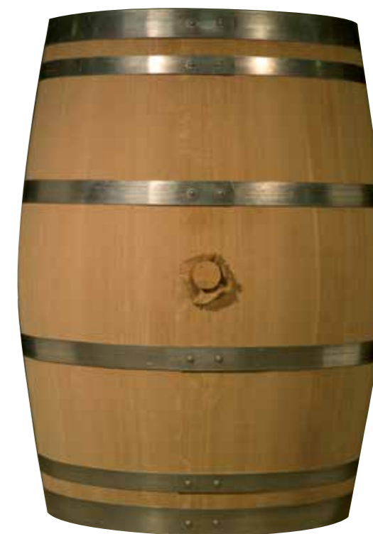
Bourgogne 228 L 6 galvanized hoops