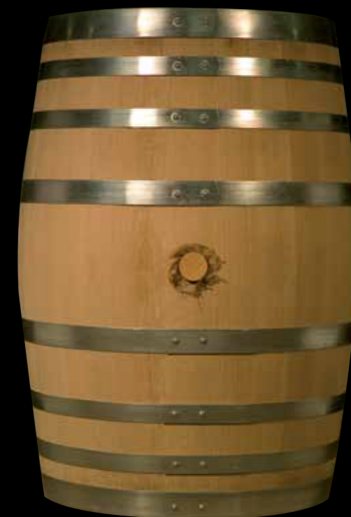
Bourgogne 228 L 8 galvanized hoops