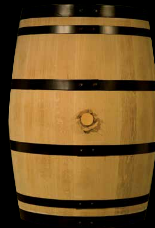
Bordeaux 225 L 6 black hoops